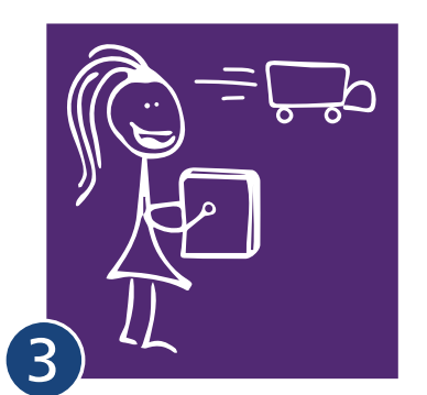
You receive the box and all your supplies