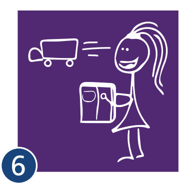
Go online and schedule FedEx pickup