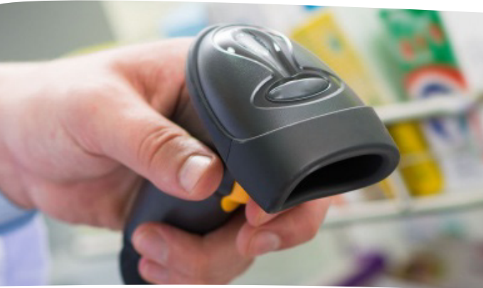
Works with any scanner